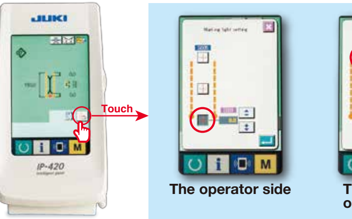
Control touch Panel (IP-420)

APW-895NE is equipped with a function to select a sewing position (from the operator side, from the counter operator side, at the center of the sewing length) when changing the length of the pocket. Note that the moving marker (option) is required if you wish to automatically move the marker line.