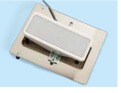
One-shot operation pedal is adopted to start the sewing machine. The sewing step is moved forward by depressing the front part of pedal, and it is moved backward by depressing the rear part of pedal.