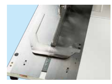
When performing welting of slacks and working pants, the pocket bag presser device clamps the pocket bag for sewing it simultaneously with welting