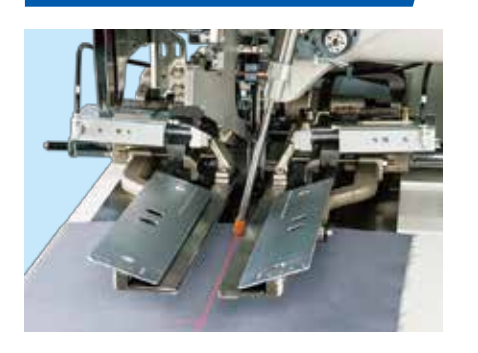
The dart stretcher clamps the end of material to smooth out the wrinkles on a garment body, thereby allowing the sewing machine to perform welting with consistency.